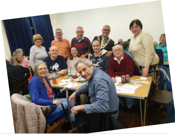
Our teams from SWAGS with the Mayor. Mayor of Stowmarket's Charity fundraiser.