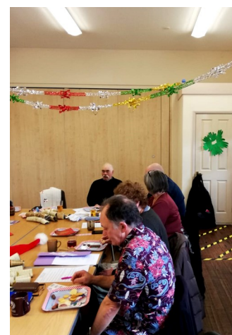
Christmas at 'Hillside'